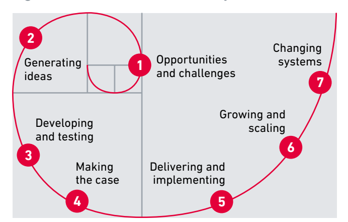
Figure 3: The social innovation spiral

Social innovation is a process, with overlapping but differing stages requiring specific tools and methodologies, skills and culture at each stage. It requires different management approaches to the traditional NGO project delivery model – including allowing for more flexibility, rapid learning and entrepreneurialism to accomplish the end goal.