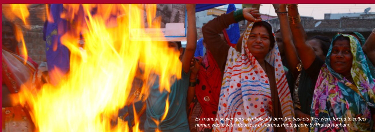
Ex-manual scavengers symbolically burn the baskets they were forced to collect human waste with.

Notions of caste purity contribute to many people's reluctance to have a toilet or latrine in their home or to clean or empty it themselves, a factor in the persistence of open defecation which in turn is a cause of disease and pollution of water supplies and a constant threat to women's dignity, safety and health. 46 The dangers associated with lack of safe sanitation in India came to international attention in May 2014 when two young Dalit girls were raped and murdered after they had gone out to the fields to defecate. 47 Caste-based discrimination and violence are perpetuated in provision and practice around water and sanitation and ending of caste prejudice essential to the achievement of SDG 6 on water and sanitation.