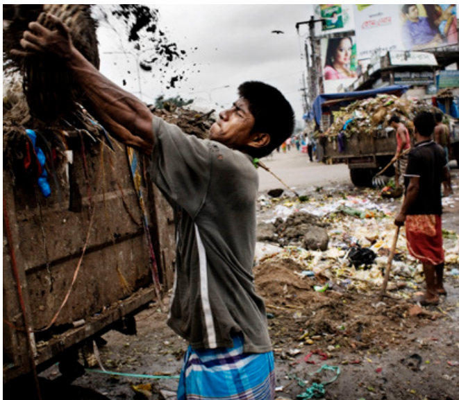
Dalit sweepers contribute to Dhaka's production of public goods, but get very few goods or services in return. The Dalit movement in Bangladesh is now growing in confidence.

The UN's 2017 Guidance on a Rights-based Approach to Descent-based Discrimination calls for analysis of how laws, social norms, traditional practices and institutional responses positively or negatively affect the realisation of rights of affected people, referring to Agenda 2030 and populations who are 'left behind'