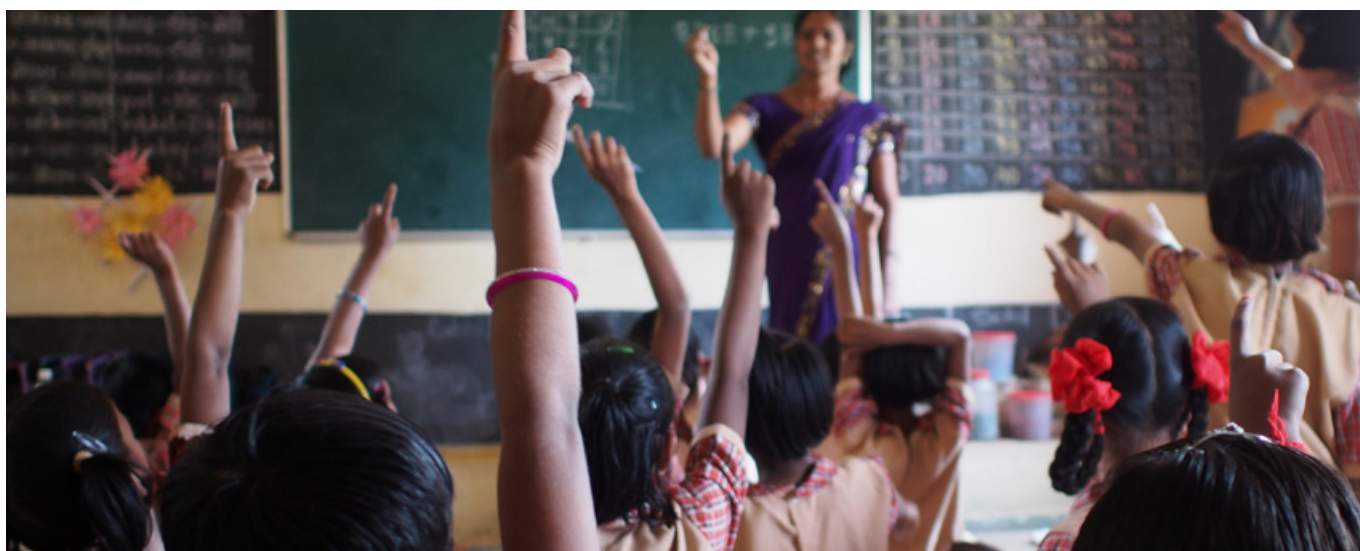
Dalit girls face the double discrimination of gender and caste. Karuna's work in village schools supports girls to stay in school by forming girls groups and engaging teachers and parents.

In South Asian caste systems, education has been regarded as the preserve of more privileged castes, and Dalit households still face many challenges in educating their children. A 2014 study in Bangladesh found that 28.5% of Dalit children were registered in school, in contrast to the national average of 96.7%, and reported that poverty, poor health and discriminatory practices within schools contribute to very high drop-out rates for Dalit children. 48