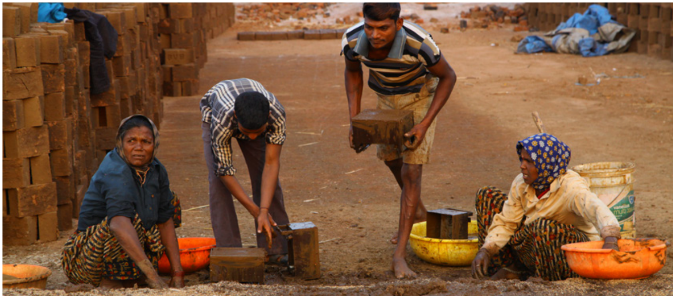
India's brick kiln factories keep many poor Dalit communities in bonded labour, forcing them to return each year to pay off their debts. The women in this family won't even get paid for their work.

Discrimination based on work and descent (DWD), which includes caste, derives from social hierarchies that enact a distinct set of human rights violations against diverse groups of people, based on their ancestry and the work they do. These systems have changed over time, but they persist and pervade many aspects of life in affected countries. They contribute to multiple inequalities and barriers to inclusive development, yet they have received limited recognition among development practitioners and the global community and its institutions.