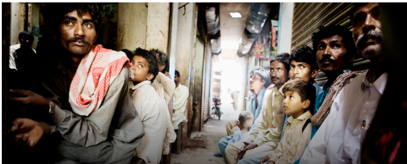
The segregation of Dalits is complete in this teashop in Karachi, Pakistan. Men from the scheduled castes are not allowed into teashops owned by dominant caste groups.

Violence against Dalits in South Asia is widespread. Persecution of Dalits who may also be religious minorities is one feature, while another is the displacement of Dalits from land or other resources. 122