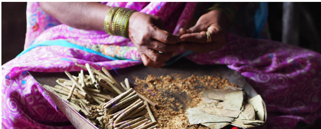
Rolling beedis - a thin cigarette made of unprocessed tobacco rolled in green leaf - and making incense sticks are some of many informal sector jobs that exploit women across India, particularly Dalits.