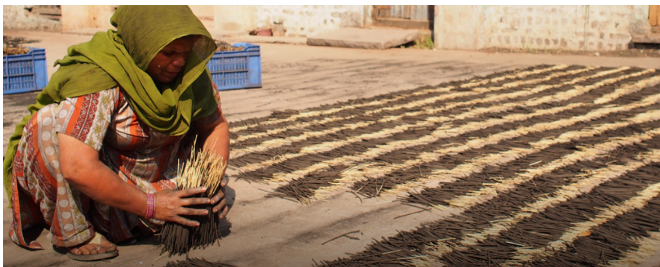
Incense making is a laborious and toxic job which exploits women across India, particularly Dalits.

While our focus has been on caste inequalities within countries, caste is also a factor in inequalities between countries. Colonial rule in South Asia exploited caste hierarchies, reserving high-status roles in colonial administrations for the privileged, while uprooting many Dalits to work as labourers, often in plantations. The descendants of many of these workers continue to produce goods (such as tea) for global markets, often under very unfavourable conditions. 90