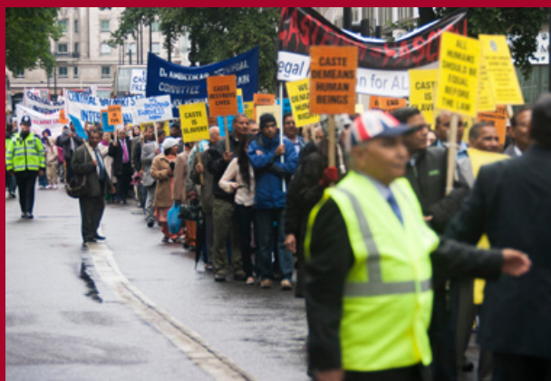
Caste Watch UK demonstrates in London against the caste system that denies equal opportunities for all.

The UK Government decided in 2018 against an amendment to the Equality Act (2010) listing caste as an aspect of race and a 'protected characteristic', on the basis of which it is illegal to discriminate in employment and access to services. While not rejecting the existence of caste-based discrimination in Britain, it was decided that the Equality Act can be interpreted to protect against caste discrimination, if caste is regarded as an aspect of ethnicity, without caste being specifically mentioned. However, many feel the inclusion of caste is necessary to raise awareness of the issue of caste discrimination among employers and service providers who have a duty under the Act.