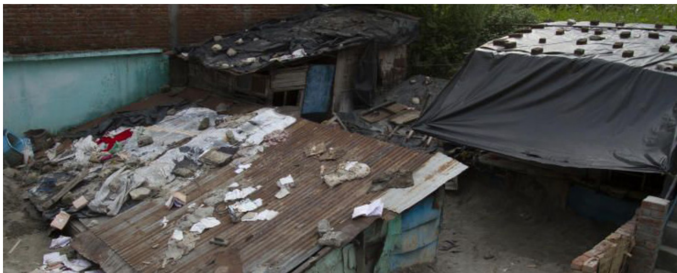
After floods in Uttarakhand, India, state houses in this Dalit community were half buried in silt and debris.

The degree of harm caused by extreme weather or incremental impacts of climate change depends to a large extent on the factors that render people vulnerable to risks or enable them to adapt. 106 People with few assets or options are worst affected, and may find themselves plunged further into poverty. 107